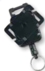
360° Rotating MOLLE Mount ACO-2018 ($4.49) Adapt to any RT2 or RT4 Gear Keeper