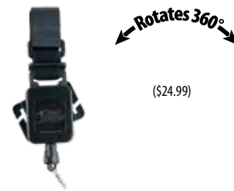
RT4-5170 Force: 3 oz Ext: 36" RT4-5171 Force: 6 oz Ext: 36" RT4-5174 Force: 9 oz Ext: 32" RT4-5172 Force: 12 oz Ext: 27"