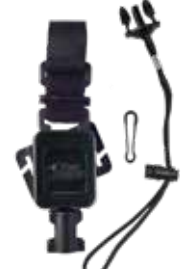
RT4-5570 ($27.49) Combo MOLLE Mount

Combo Mount includes two mounting systems in one! Velcro Strap Mount: Loops & cinches around gun belts or to MOLLE Rotating MOLLE Mount: Clips to MOLLE - Rotates 360 degrees Ideal for chest-mount holsters