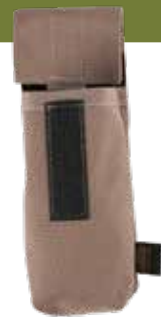
• For Laser Pointers, Tactical Flashlights HR9-0541 Retrac Flash Holster Coyote Holster: 1¼" x 1¼" x 5", MOLLE Mount Retractor: Force; 6 oz. Extension: 36" ($42.49)

Integrated System is Compact, Quiet & Secure Holster provides secure storage for your gear while hiking Integrated retractor prevents loss or damage