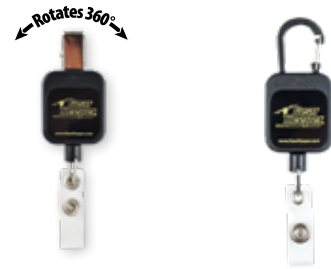
RT5-5813 ($9.99) Spring Clip 40# Break Strength High-Tensile Spectra®/Nylon Line Badge Attachment End 2.5 oz. /36" RT5-5816 ($9.99) Carabiner