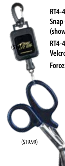
RT4-4441 Snap Clip Mount (shown) RT4-4431 Velcro Strap Mount Force: 6 oz Ext: 32"

Also available in Stainless Steel Cable, however we recommend Spectra-Nylon for most applications