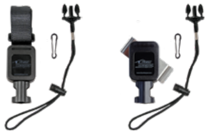
RT2-5530-A ($24.99) Velcro Strap Mount: The most common version Loops & cinches around gun belts or to MOLLE RT2-5550-E ($26.99) SS Rotating Belt Clip: Interlocking attachment to gun belts up to 2.25" Easy to install or remove

No resistance on firearm—acts as safety tether. Recommended when firearm is extended for long periods