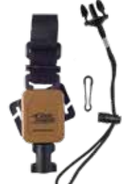
RT4-5570-C ($27.49) Combo MOLLE Mount Coyote

Combo Mount includes two mounting systems in one! Velcro Strap Mount: Loops & cinches around gun belts or to MOLLE Rotating MOLLE Mount: Clips to MOLLE - Rotates 360 degrees Ideal for chest-mount holsters