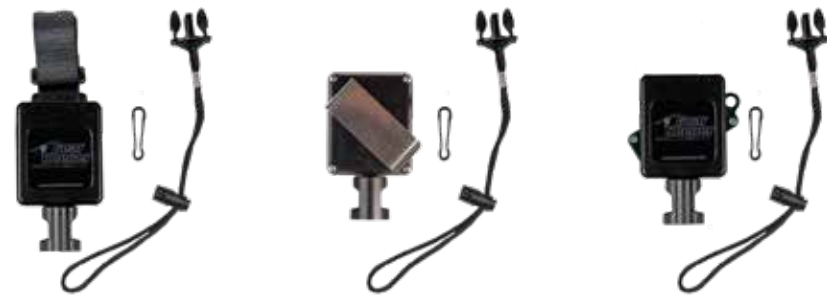
RT3-5533 ($29.99) Velcro Strap Mount: The most common version Loops & cinches around gun belts or to MOLLE RT3-5553-E ($32.99) SS Rotating Belt Clip: Interlocking attachment to gun belts up to 2.25" Easy to install or remove RT3-5563 ($34.99) Rotating Clamp-On: Assembles to gun belts up to 2.25". Very secure con- nection; will not dislodge

Will suspend firearm —stabilization force while aiming Recommended for short duration use