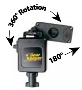
Multi-Mount: Clamp-On 2-Axis Rotating Belt Clip Available Retraction For